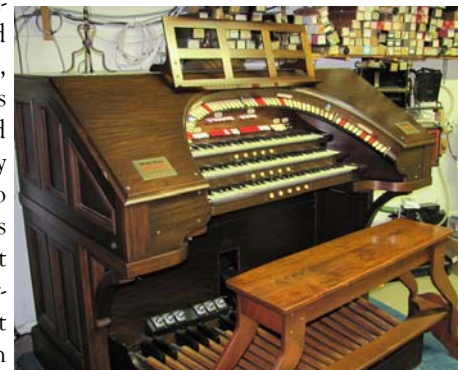
Dave Voydanoff's 3/10 Wurlitzer Theatre Organ

pipe organs outside of the Senate Theater. While the Senate may be silent until September, the wonderful sounds of theatre pipe organs are still going strong! Come be a part of these special events!